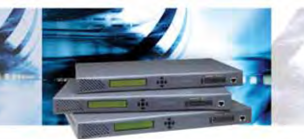
SecureLinx<sup>™</sup> SLC Console Managers