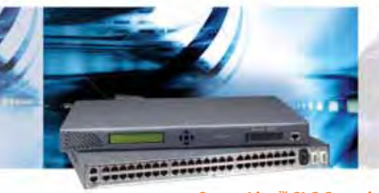
SecureLinx<sup>™</sup> SLC Console Managers